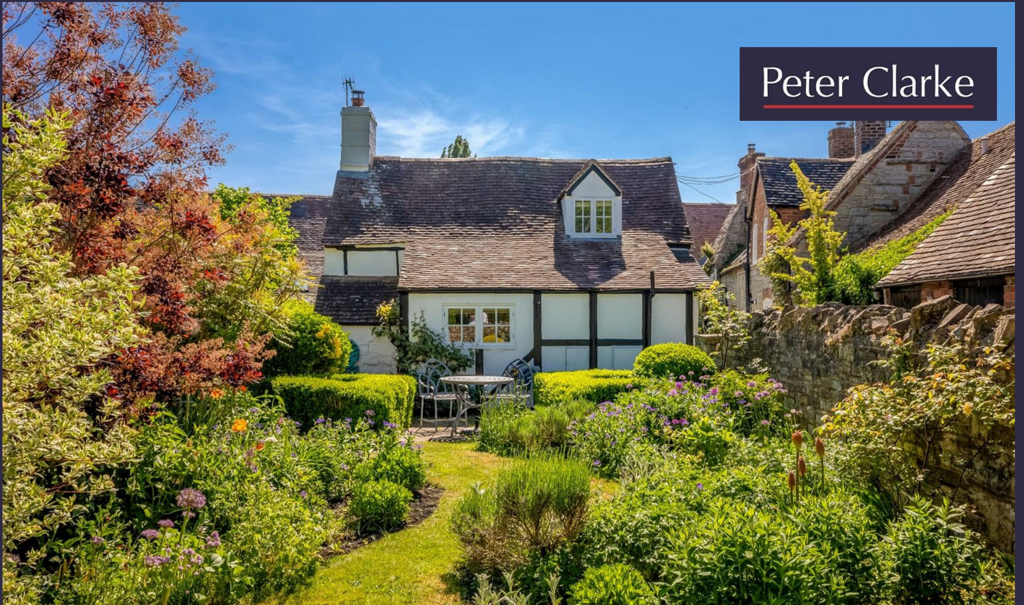
Lantern Cottage, 2 The Hamlet, Marlcliff, Alcester, B50 4NT